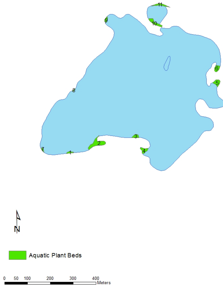
Map 2. Location of the aquatic plant beds detected in Clear Pond during the surface survey on 10 June 2013. Data for the plant beds can be found on Table 1.