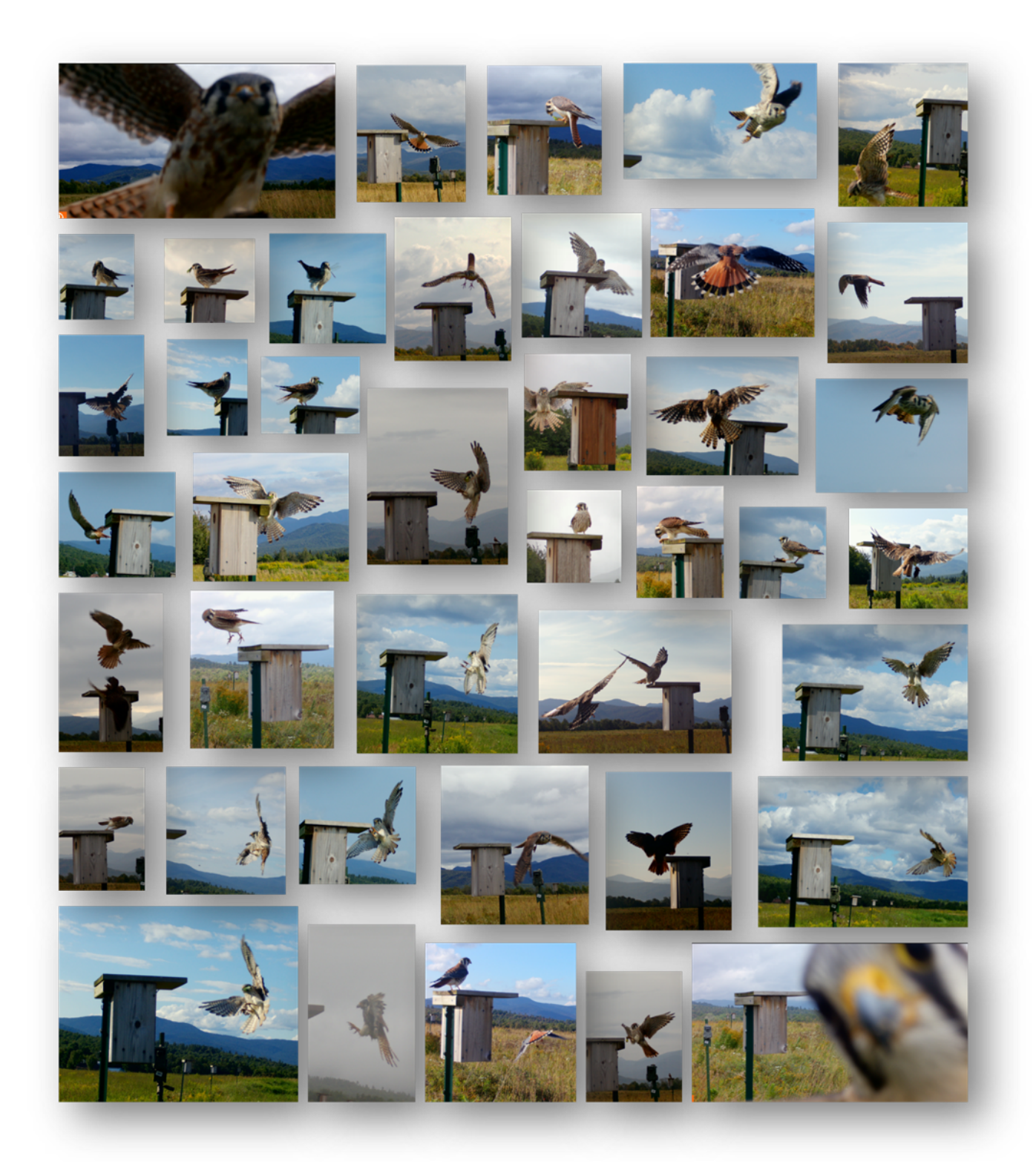
Figure 2. American kestrel images captured by trail camera at Uihlein Farm, 2023.