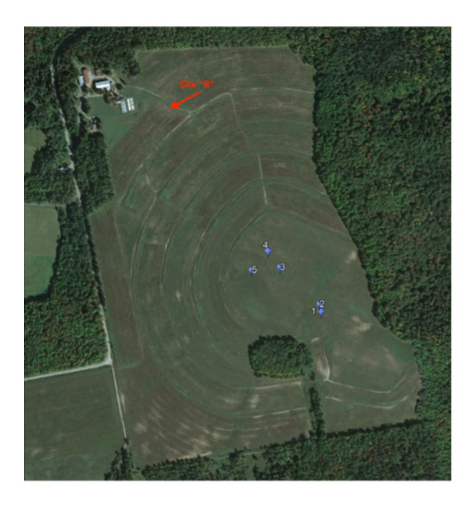
Figure 3. Location of 2021 soil tests and grass seed test plots (#3 and Site B).

valued wildlife plant cover: (1) Schizachyrium scoparium, Fort Indiantown Gap-PA Ecotype (Little Bluestem, Fort Indiantown Gap-PA Ecotype), (2) Andropogon gerardii, Albany Pine Bush-NY Ecotype (Big Bluestem, Albany Pine Bush-NY Ecotype), and (3) Sorghastrum nutans, 'Southlow'-MI Ecotype (Indiangrass, 'Southlow'-MI Ecotype). These species are also known to grow locally, but are not common, and were not known to occur on Uihlein Farm. Soil tests were undertaken in three areas of the potato fields (described in 2021 report). Based on the pH site requirements for the target species in the test plots, location 3 was chosen for the planting (Figure 3).